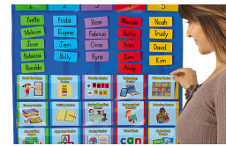
MANAGEMENT & GROUPING