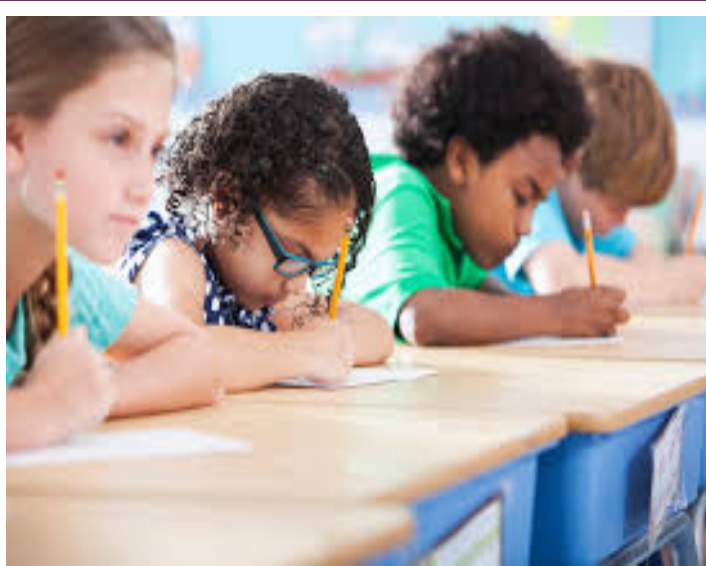
Writing Workshop Teacher Guide Common Core Edition